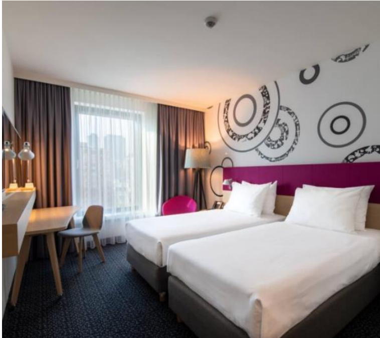
202 Standard Rooms