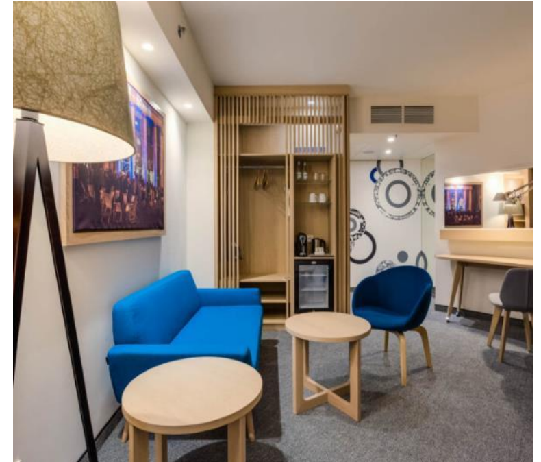
14 Junior Suites Rooms