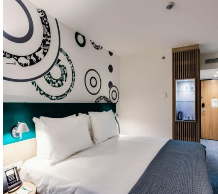
40 Executive Rooms